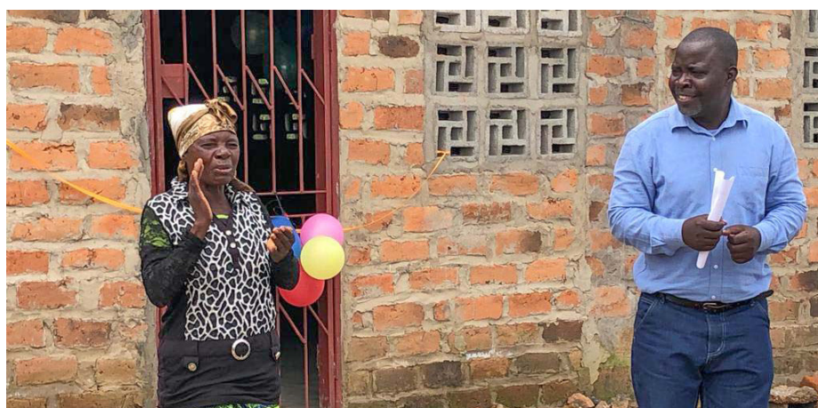
Miswa Life Centre Opening