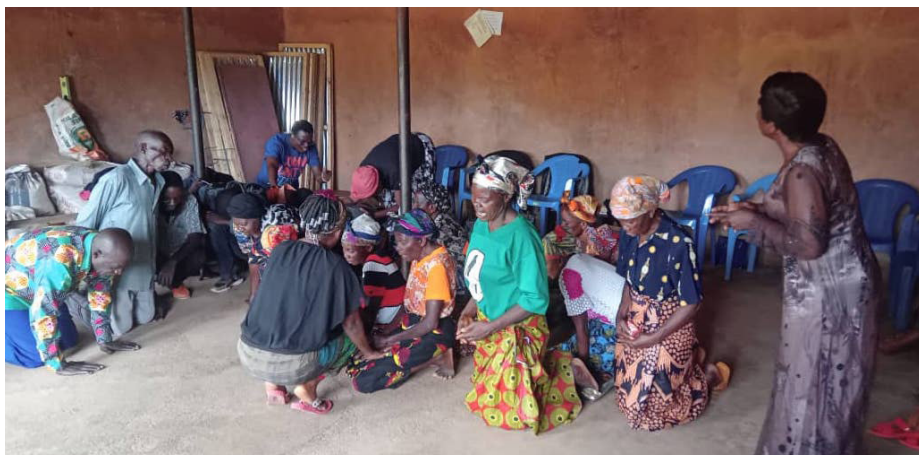
Kisunka Maranatha Workshop