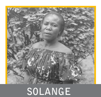
Field Coordinator (since 2020) | from the Democratic Republic of the Congo