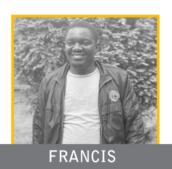
Bookkeeper (since 2017) | from the Democratic Republic of the Congo