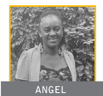
Service Centre Coordinator (since 2008) | from the Democratic Republic of the Congo